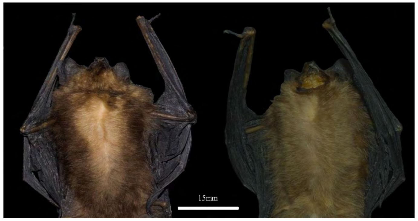
FIGURE 2. Dorsal and ventral views of the specimen of Rhogeessa hussoni (ALP 9656) from Refúgio da Vida Silvestre Mata do Junco, Sergipe, northeastern