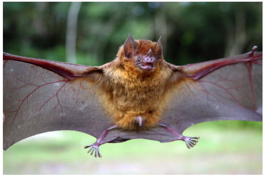
Figure 2. Male Lampronycteris brachyotis captured in Reserva Natural Morro da Mina, state of Paraná, Brazil.

The specimen (Figure 2) has all characters reported to L. brachyotis (Sanborn 1949; Medellín et al. 1985; Genoways and Williams 1986; Nogueira et al. 2007): dorsal fur orange brown, with pale orange basis; head, face and throat bright orange; ventral fur pale orange; ears, wings and interfemural membranes dark brown; calcar longer than foot; pinnae short and with pointed tips; interauricular band absent; third metacarpal longest, fifth shortest; second phalanx of wing digits III and V longer than first; orbital foramen between the second upper premolar and the first molar; first pair of upper incisors chisel-shaped and in line with canines; second pair of upper incisors bifid, with more elongated inner cusp, and in contact with central incisor; second lower premolar reduced relative to both first and third, which are subequal in size.