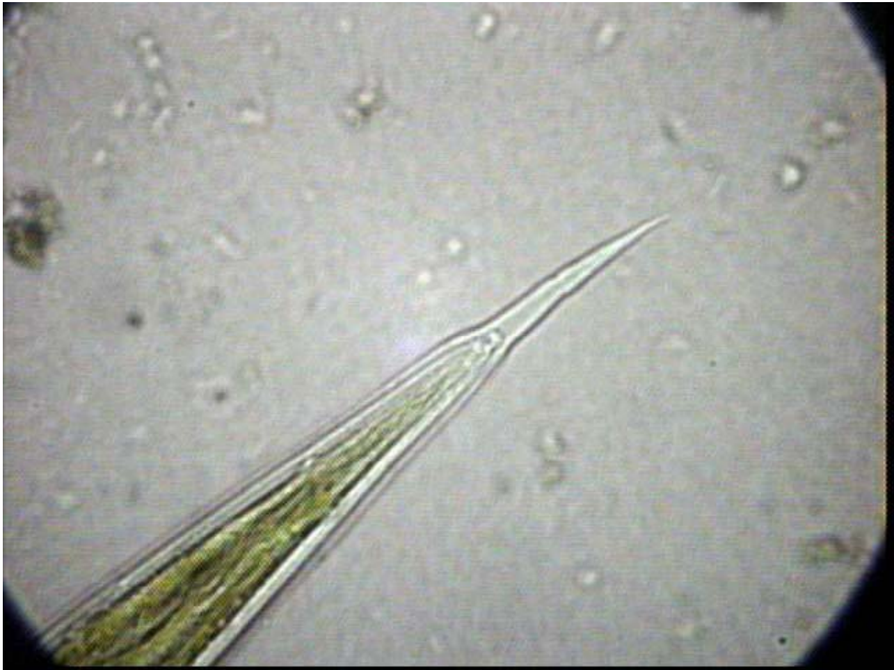
5 tri pos