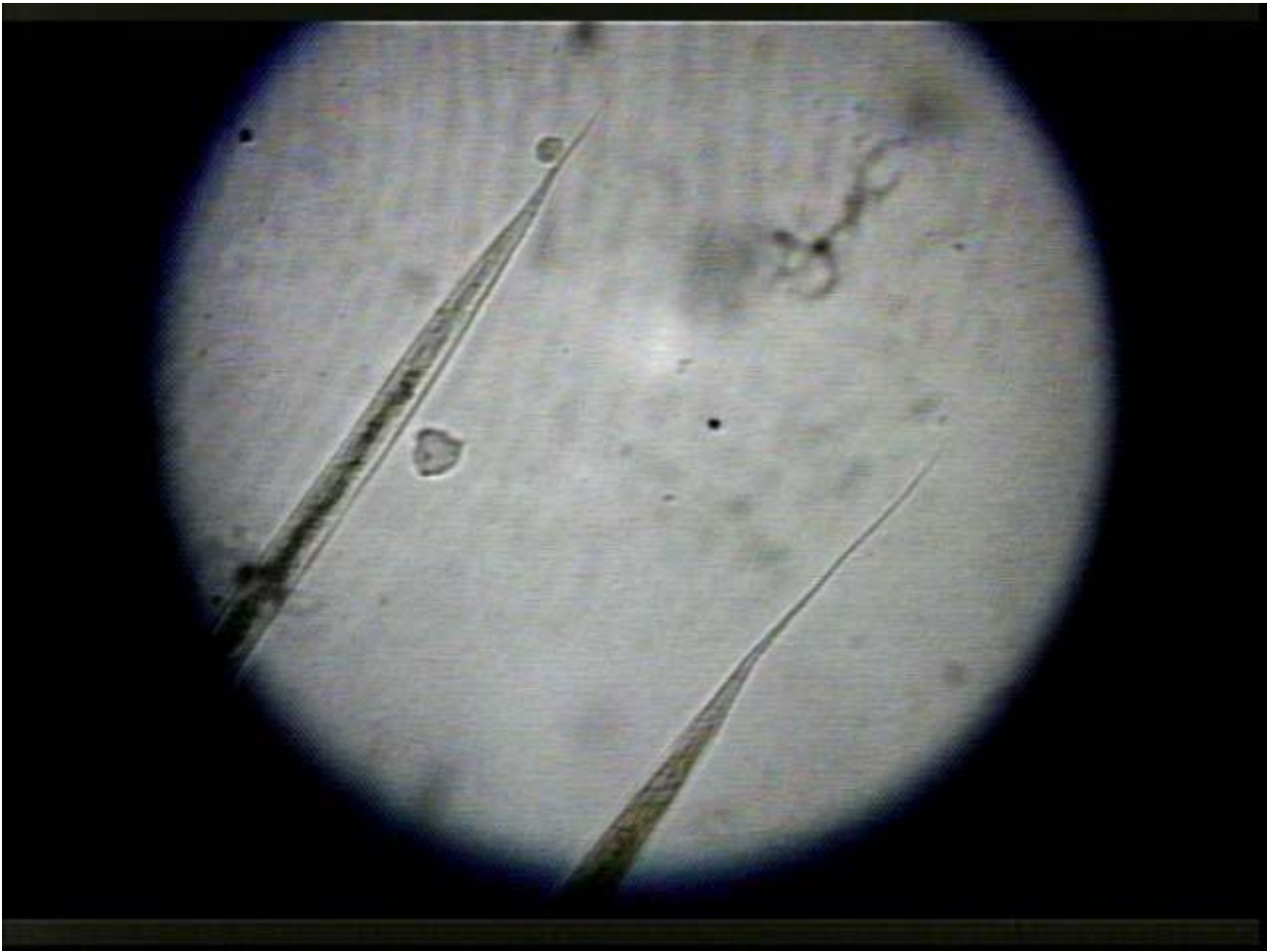
hae ost post 2