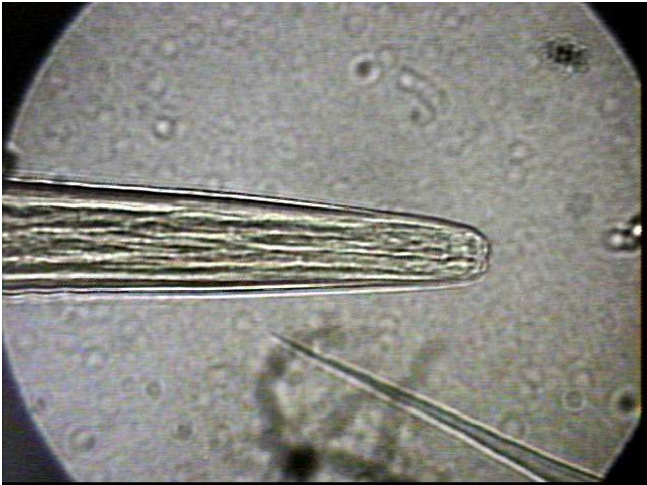
cooperia anterior 2