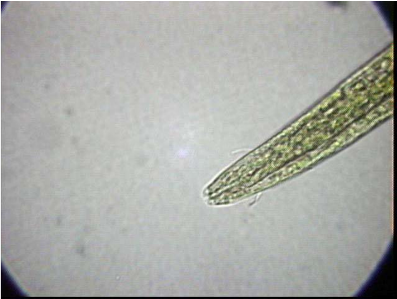
oes ant 1