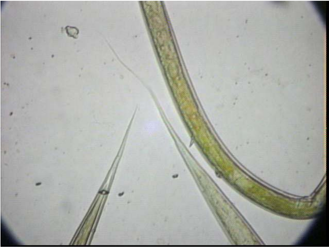
6 hae oes pos