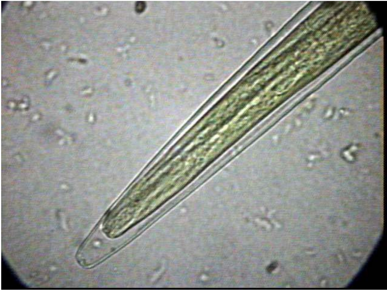
tri ant 2